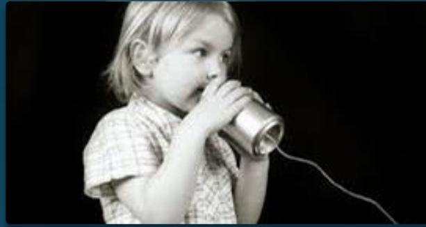
Sharing the message